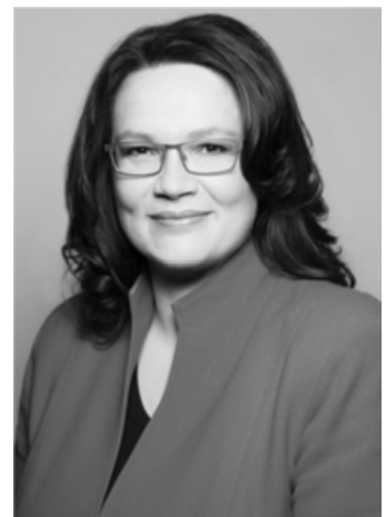
Andrea Nahles Federal Minister of Labour and Social Affairs

The social state and the social market economy characterise the Federal Republic of Germany, make its name ring true around the world and provide a better life for those who live here. I want us to work together to ensure it stays that way.